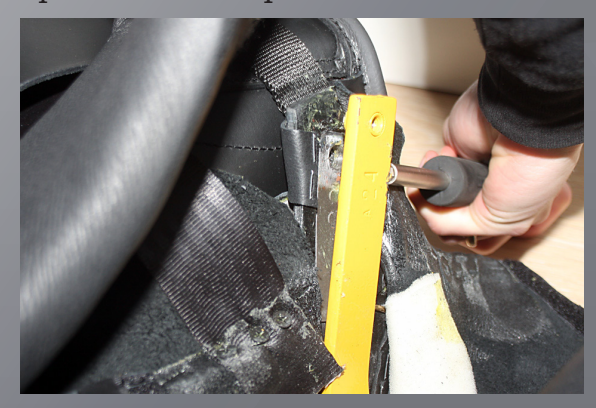
4. Loosen gullet iron with fingers or a flat screwdriver