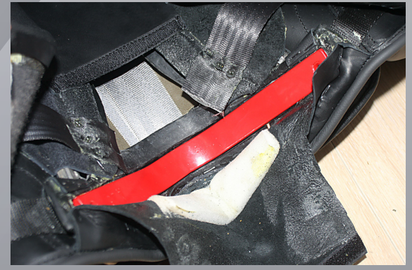
6. Insert new gullet iron, and insert bushings into corresponding holes